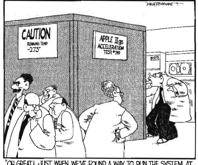
"OH GREAT! JUST WHEN WE'VE FOUND A WAY TO RUN THE SYSTEM AT HIGHER SPEEDS, YOU GUYS HAVE TO PLAY 'DOUBLE-DARE' WITH THE COOLING CHAMBER."

Mensch's strategy is intriguing. The institutionally-oriented IBMs and InfoWorlds are forever talking about multiuser systems. Massive institutional systems have hundreds of terminals attached to them and